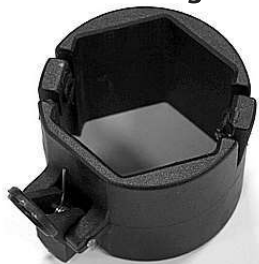
ATHLHA-G Leg Height Adjuster