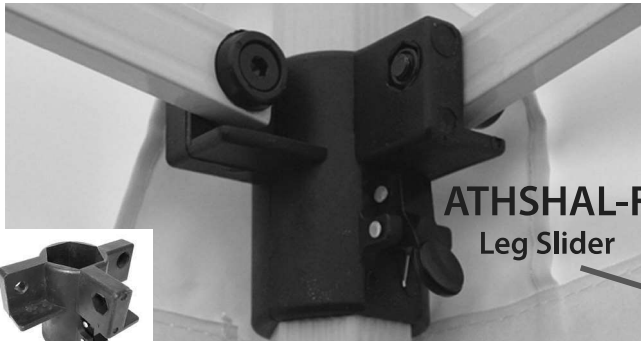
ATHSHAL-F Leg Slider