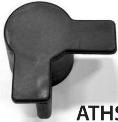
ATHSHAL-H Corner Leg Cap