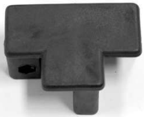
ATHSHAL-E Truss Connector